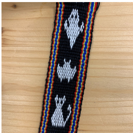
Al Sadu technique, warp scheme as described above

When using the Al Sadu technique, all patterns start in a heddled row