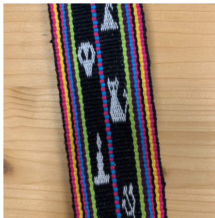
Al Sadu technique, doubled the pattern part with plain weave in between the two pattern parts.